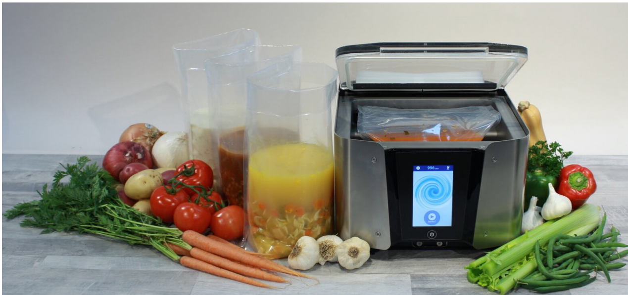
Table Top Vacuum Sealer

Call for PBI Service: (562) 595-4785 or (209) 839-9280 (Toll Free) 1-800-421-3753