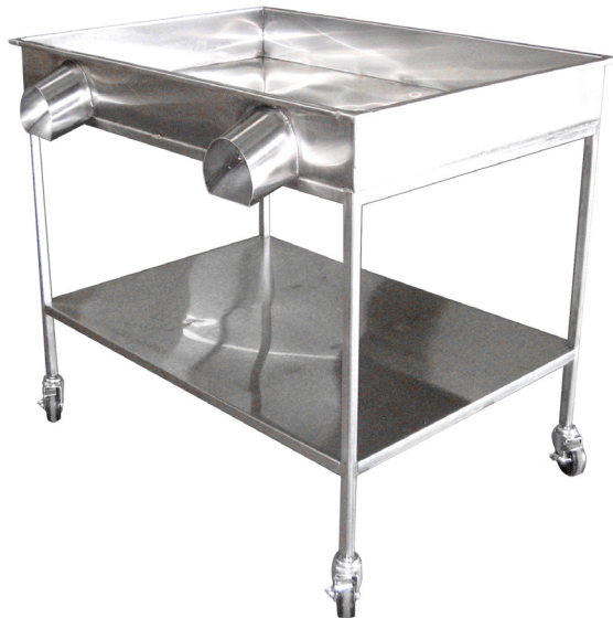
7158835 S/S Chip packaging table on casters with two chutes. 48" x 35" x 32"