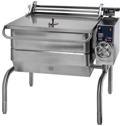
7050304 30 Gallon Braising Pan with manual tilting, natural gas, electric ignition - up to 350 38.5" x 39.75" x 37"